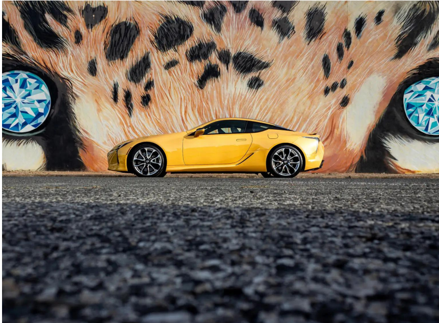
Above: Lexus LC500 Ad Campaign feature 2020

Our festival and murals have been featured in an array of platforms and media outlets. Notable features: CNN, Texas Highways, Texas Monthly, Houston Chronicle, Business Insider, Lexus advertisements, travel blogs and more.