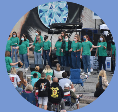
2021 TAMF kicked off by featuring Brenham High School Varsity Choir