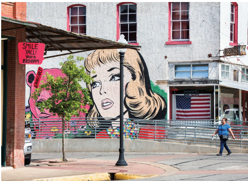
Above: Texas Monthly feature, Issue September 2018, Photo: Tom McCarthy