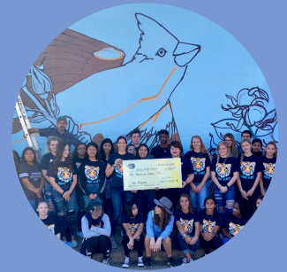
2019 TAMF donated funds to three local school art programs