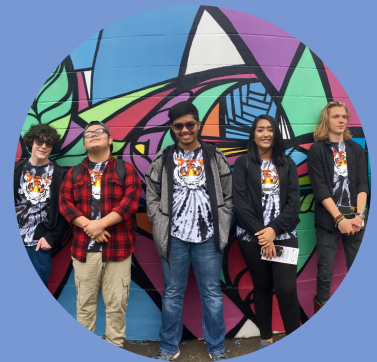
Annually TAMF hosts free enrichment opportunities for students to get hands-on experience & meet featured artist